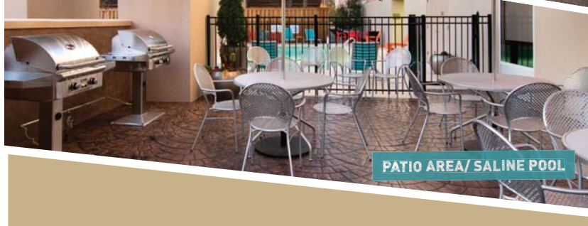
PATIO AREA/ SALINE POOL